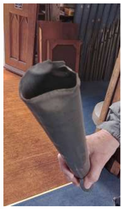
Phase 2 of the Church Projects Begins

The church organ has been carefully dismantled and has now been removed for a major overhaul and refurbishment. Above left shows the work following removal of the outer casing, while above right is an example of the condition of many of the pipes which have been subject to a rather crude form of tuning from many years ago.