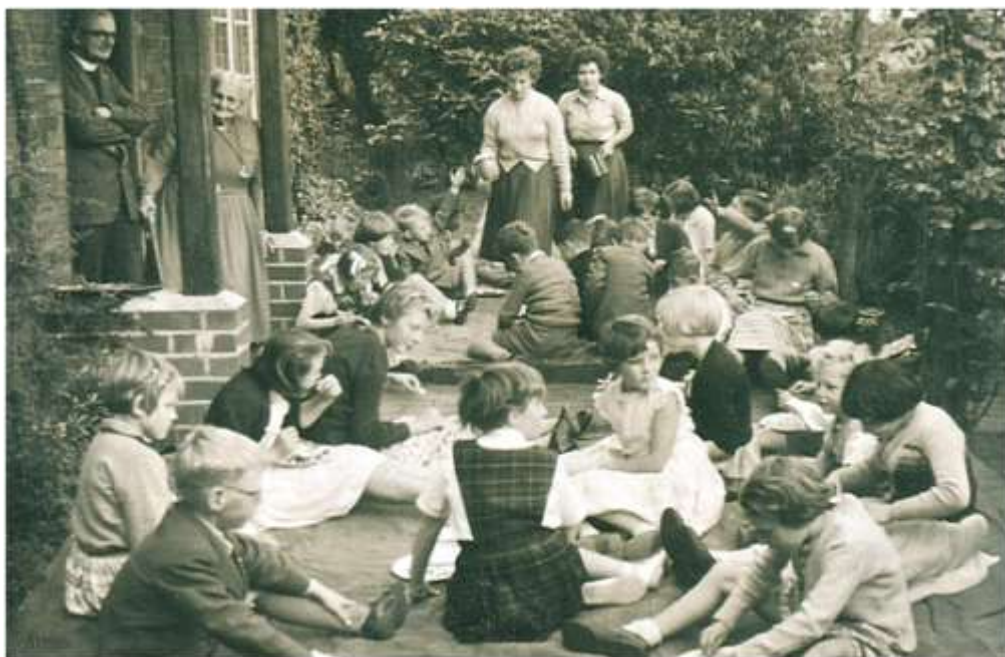
Sunday School Afternoon Tea at Grove Farm